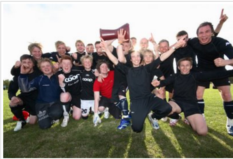
Sami cup winners Stil

I was in the far north of Norway last week, to see the Sami Cup. Here's an extract from my account of the tournament for The Guardian :